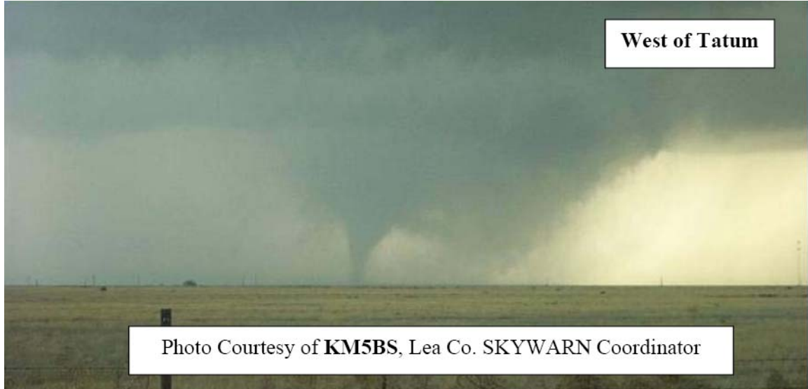
Tornado west of Tatum, New Mexico

More severe weather popped across eastern New Mexico and western Texas over the weekend. Spotters were active early on Sunday afternoon around Lubbock, TX as possible tornadoes were reported.